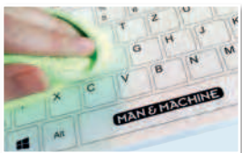
SINGLE WIPE CLEAN