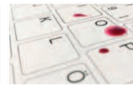
DETECT INFECTIOUS SPLATTER INSTANTLY