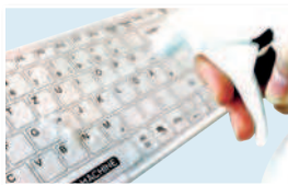
USE STANDARD HOSPITAL APPROVED DISINFECTANTS