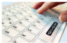
TACTILE FEEL AND SPEED OF STANDARD KEYBOARD