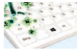
KEEPS GERMS OUT