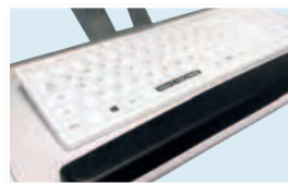
FITS ON KEYBOARD TRAYS AND CARTS